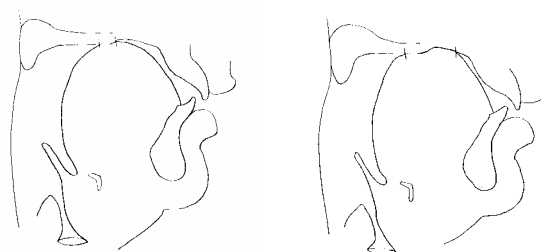
Figure 2. This figure shows velar contact extents for /g/ (left) vs. /gg/ (right). Speaker SF.

Articulatory analyses , from the X-ray data, were carried out to see how the phonological contrast is highlighted on the articulatory level. Measurements obtained from mid sagittal profiles show that contact-extents (maximum value for contact) are longer for geminate consonants than for their singleton counterparts (see Figure 2 , for an illustration).